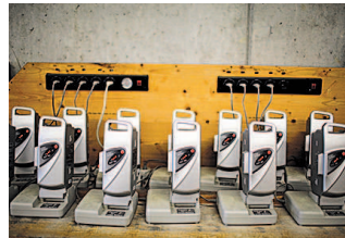
FROM TOP Route signs; controls show intensity of power and battery level; e-bike batteries.

also offers five-day tours of the Heart Route from 1,280 Swiss francs a person, or about $1,600 at $1.25 to the franc, including guide, three-star hotels, bike rental and luggage transport (41-41-418-65-65; baumeler.ch/reise-velo-herzroute-21427.php , in German).